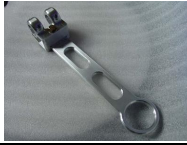
Standard Long Version